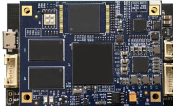
Front-side & Back-side view of Voyager-2X (Dual-Layer)